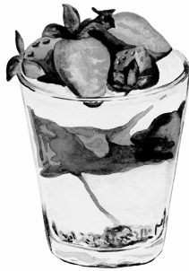
Quick Fry Pan Granola