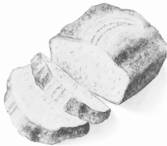
Flourless Banana Bread