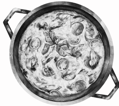
Three Cheese Breakfast Spinach Frittata